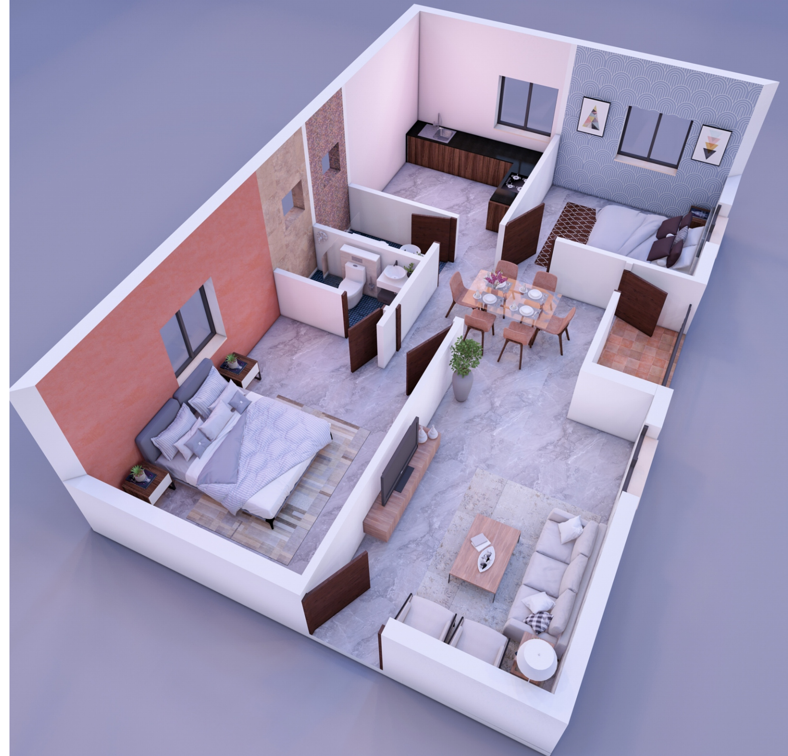
3D VIEW - C DHURUV BLOCK