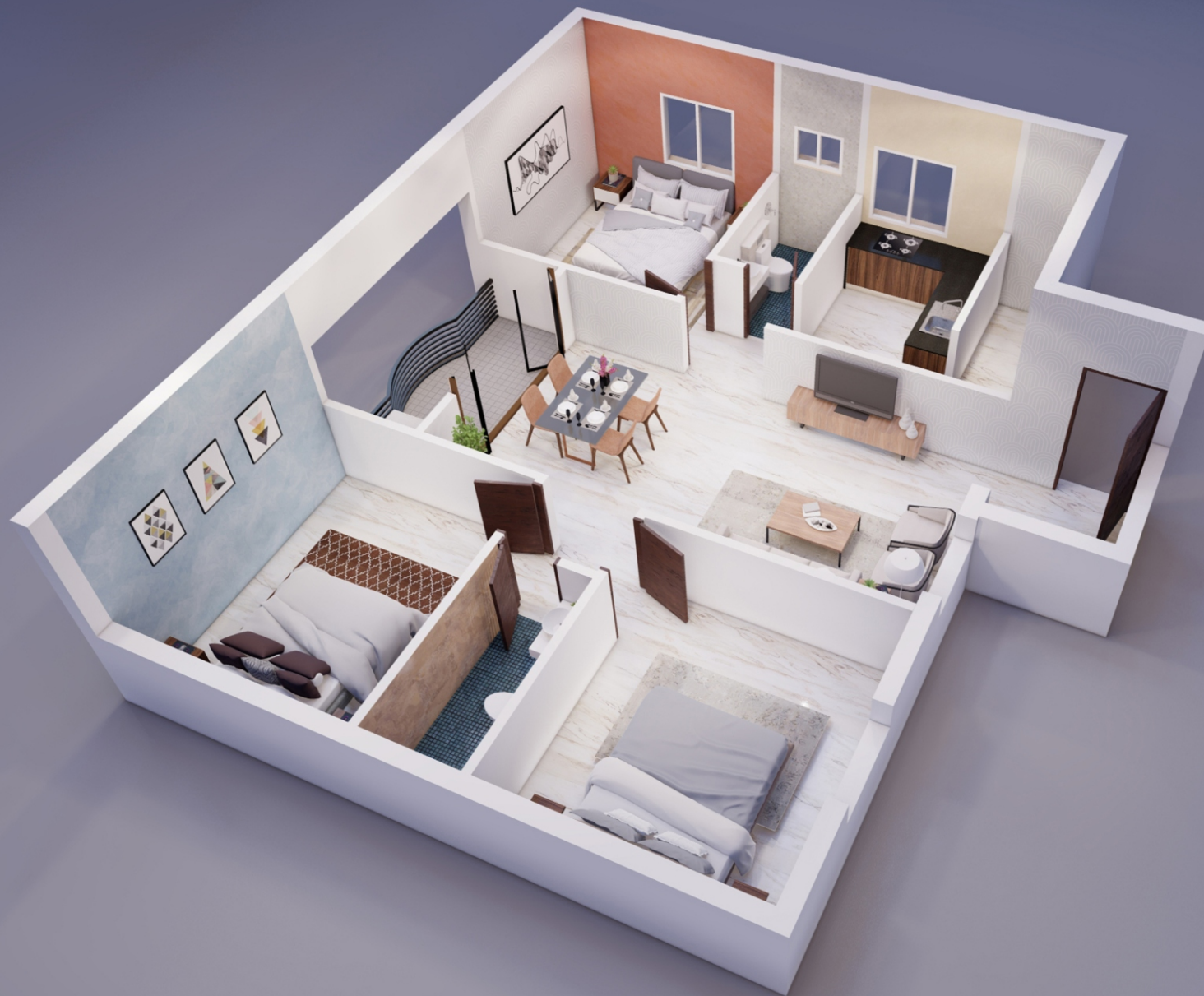
3D VIEW - G AAROV BLOCK