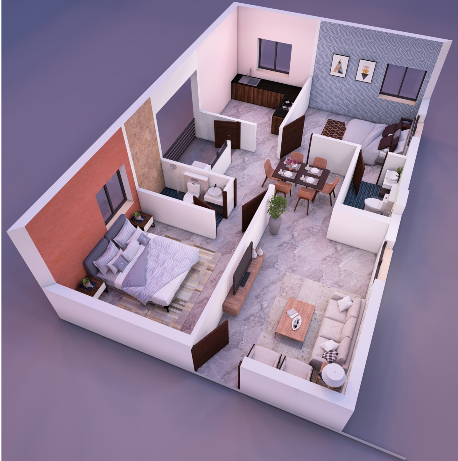
3D VIEW - B DHURUV BLOCK