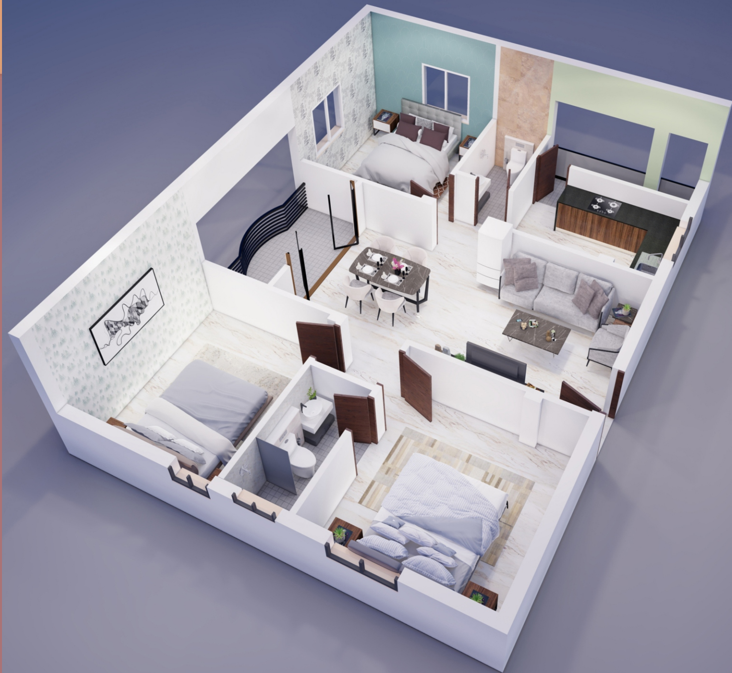
3D VIEW - H AAROV BLOCK