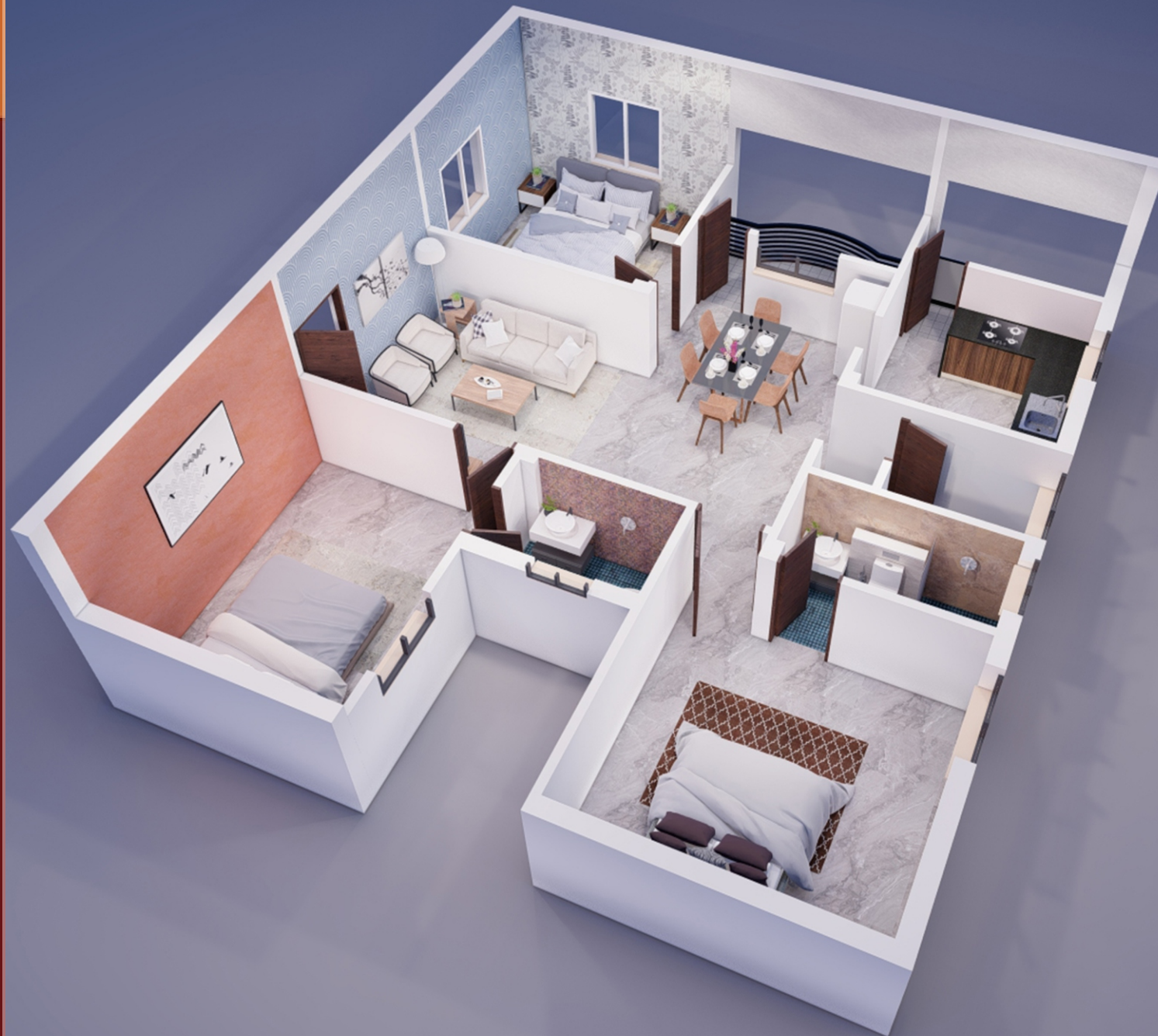
3D VIEW - I AAROV BLOCK