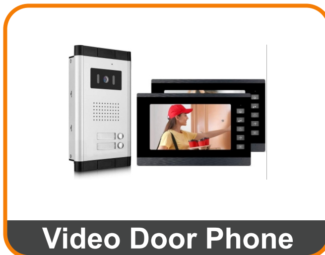
Video Door Phone