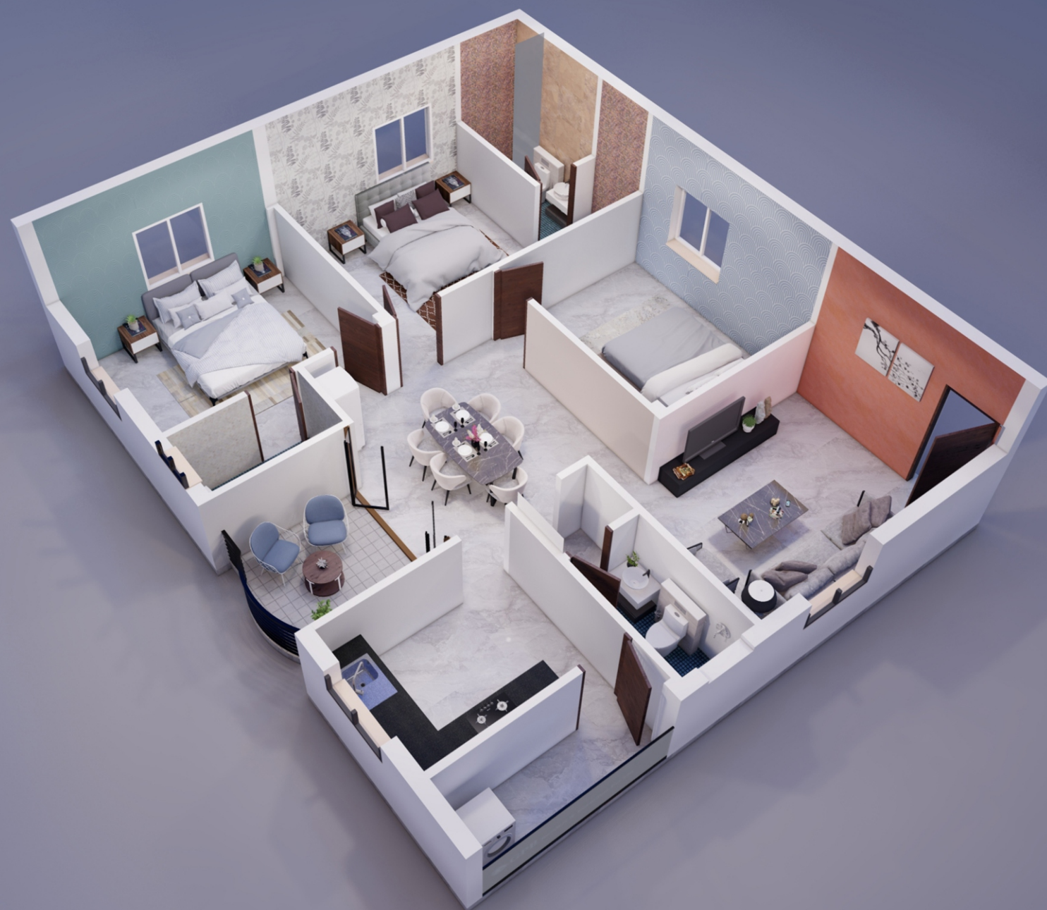
3D VIEW - E AAROV BLOCK