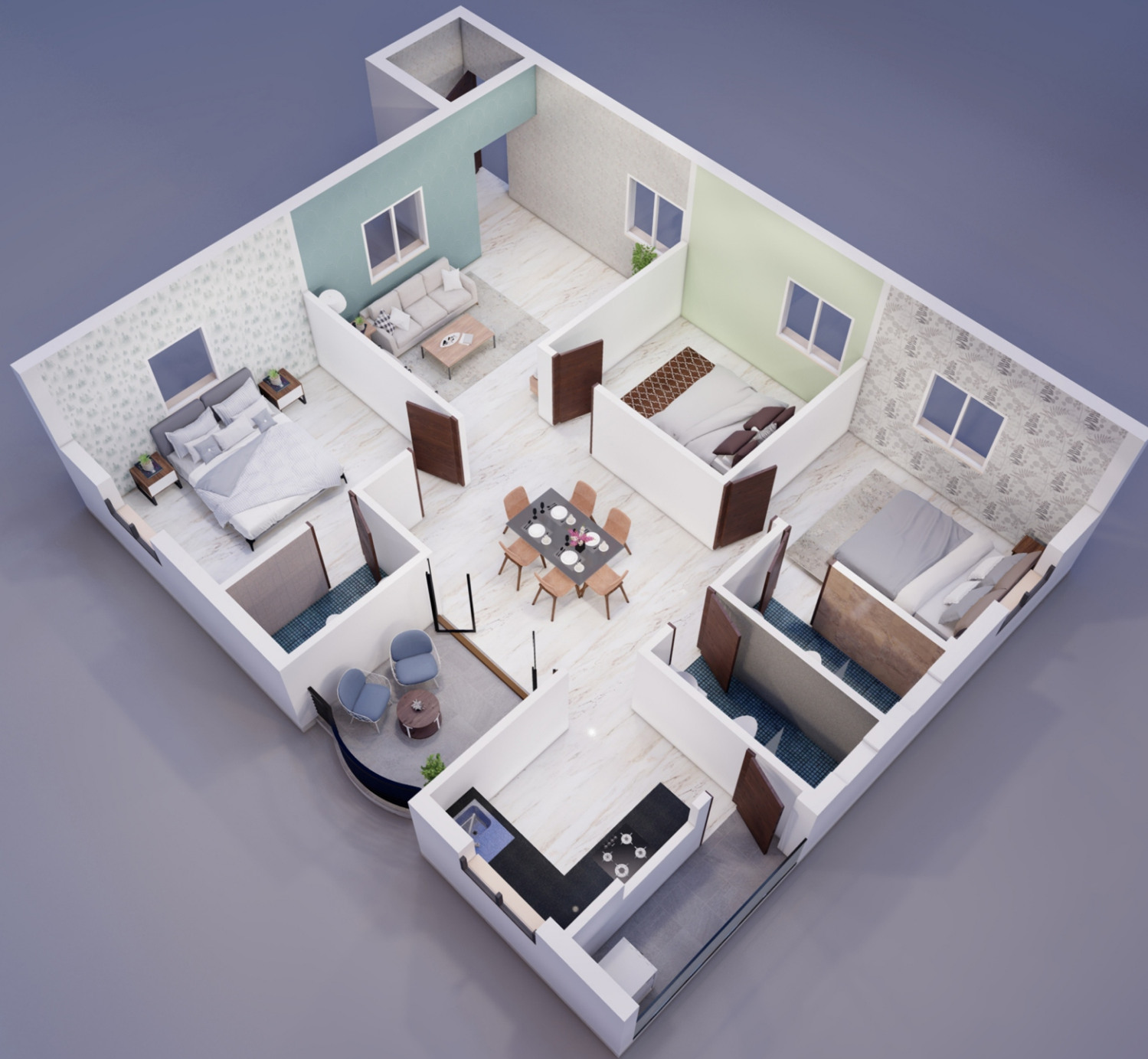
3D VIEW - J AAROV BLOCK