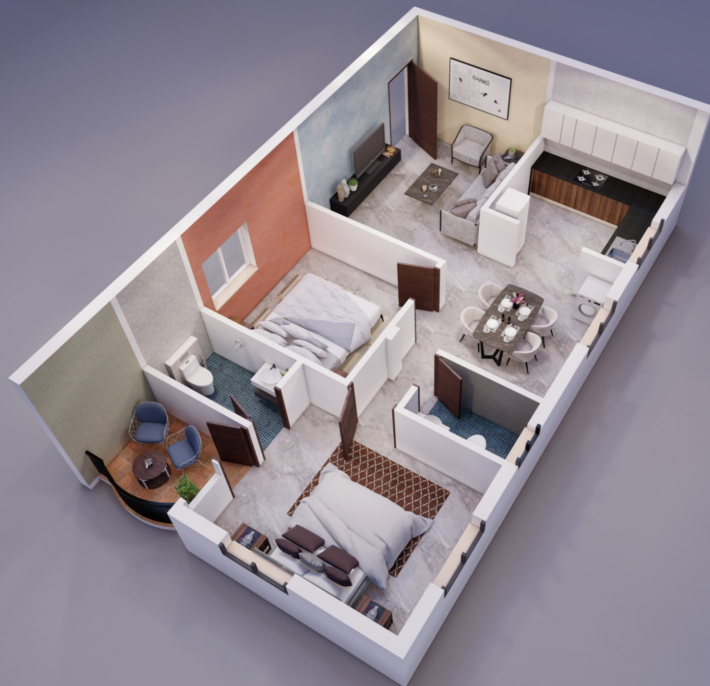
3D VIEW - F AAROV BLOCK