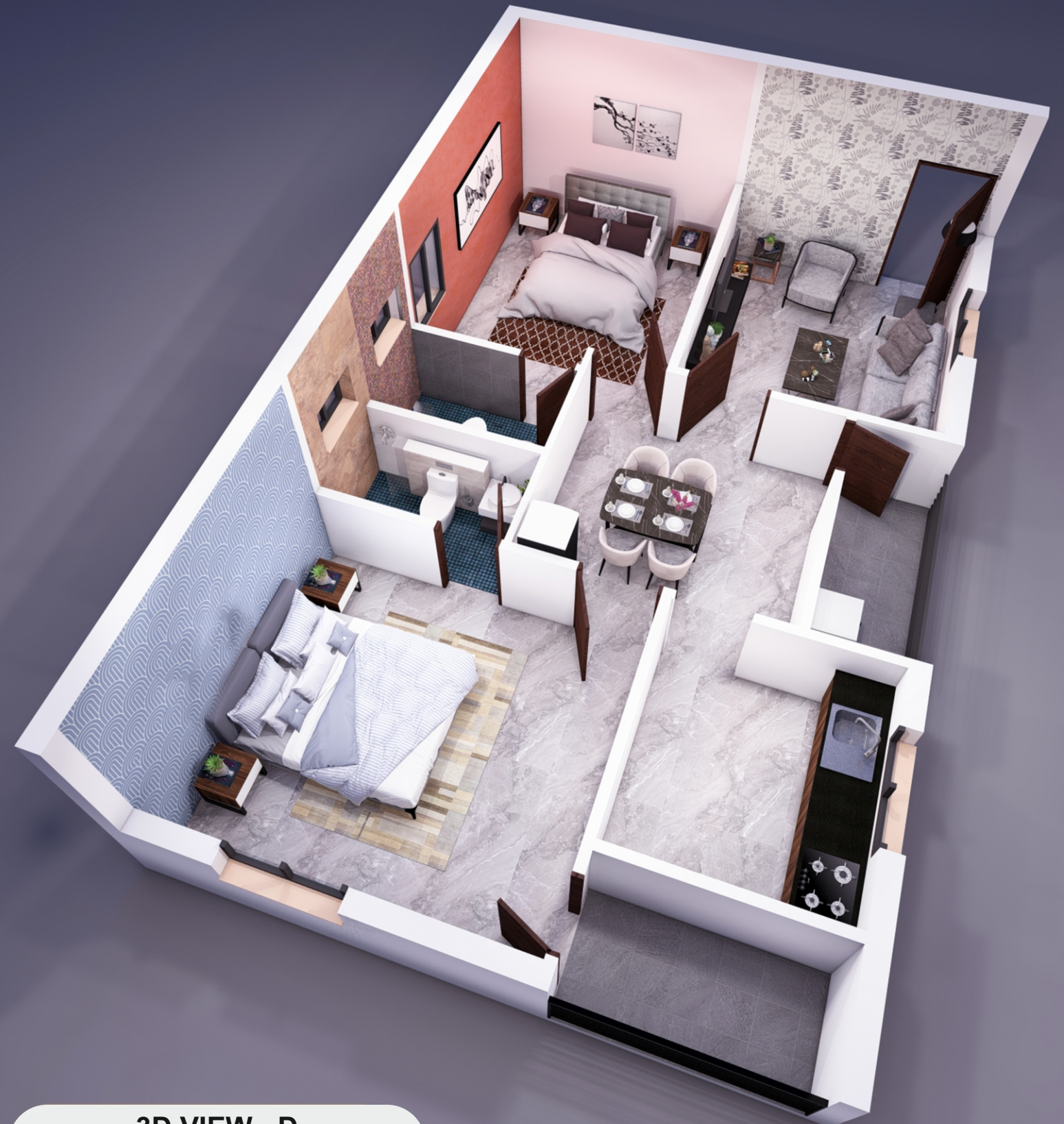
3D VIEW - D DHURUV BLOCK