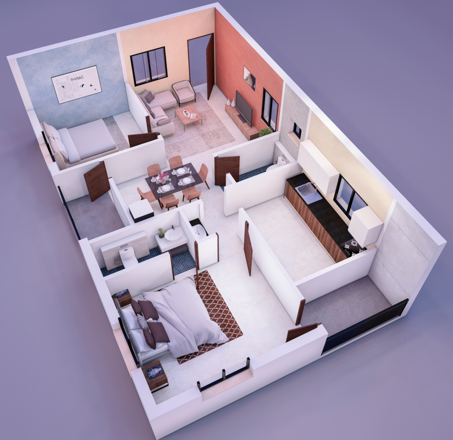
3D VIEW - A DHURUV BLOCK